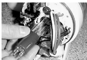
Figure 26 (Internal Power Supply) Removing lamp